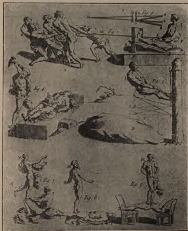
FEATS OF STRENGTH (Plate 19)