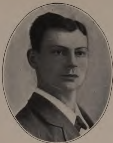
YAMADEVA From portrait taken in 1876