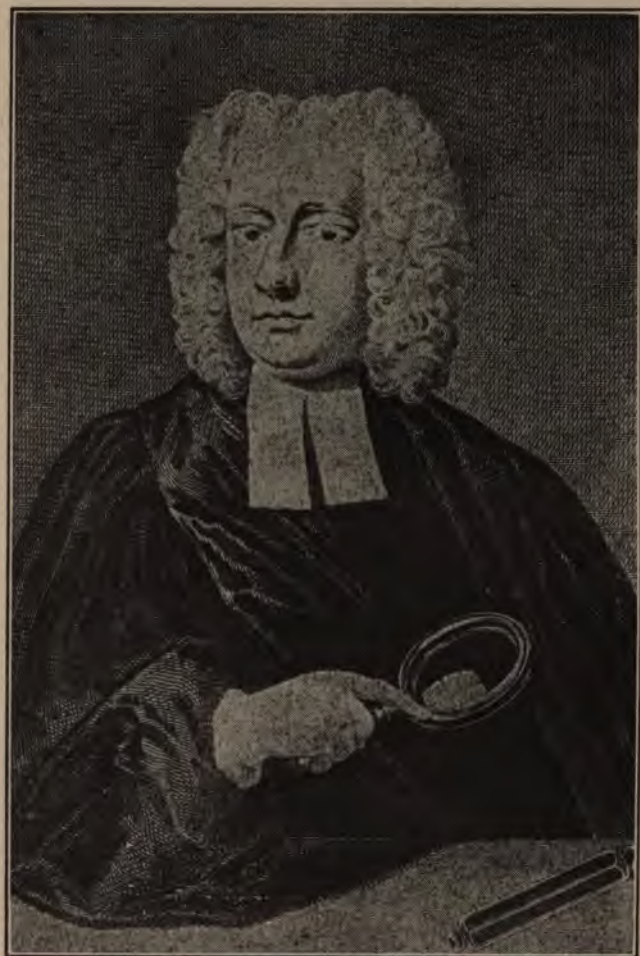
DR. JEAN THEOPHILE DESAGULIERS