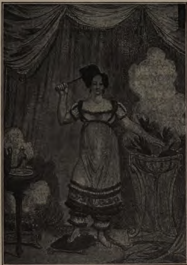
MADAME GIRARDELLI "The Celebrated Fireproof Female"