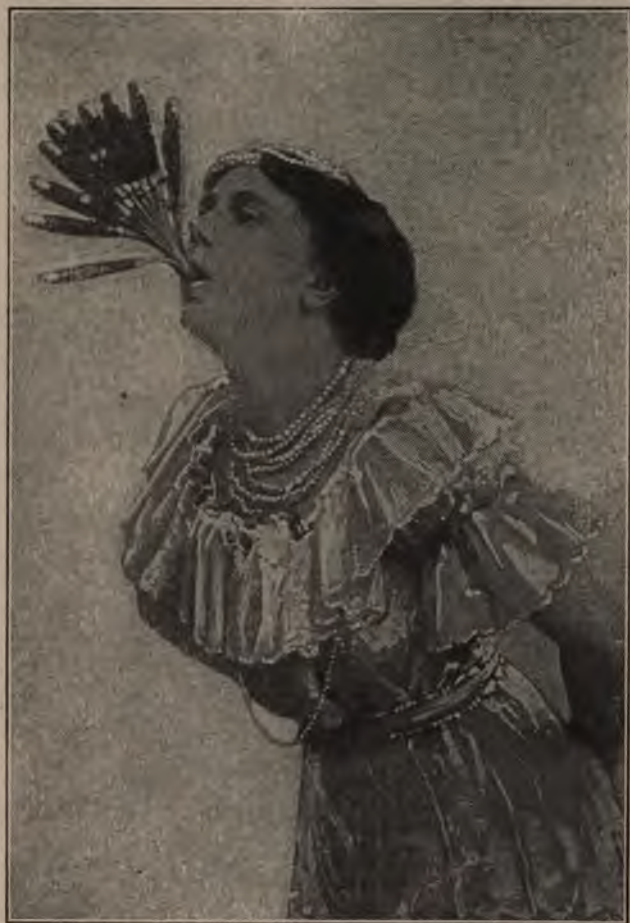
EDITH CLIFFORD "Champion Sword Swallower of the World"